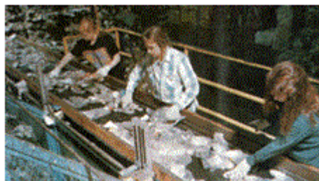
Workers at a recycling plant sort different of types plastics

The plastics we all know as Silly Putty were invented by an engineer in the 1940s -- he originally called it Nutty Putty because of its ability to stretch to many times its original size