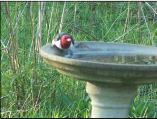
Red-headed woodpeckers at Kedzior sanctuary