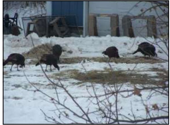
Turkeys in the backyard