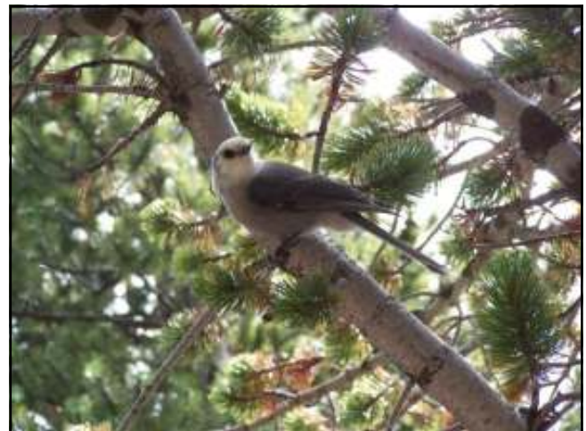
Gray Jay from Rocky Mountain National Park

Share your photographs with the EAS membership. If you have photographs of local wildlife or recent nature hikes, please submit them to the EAS Newsletter. Send them to joskog@gmail.com