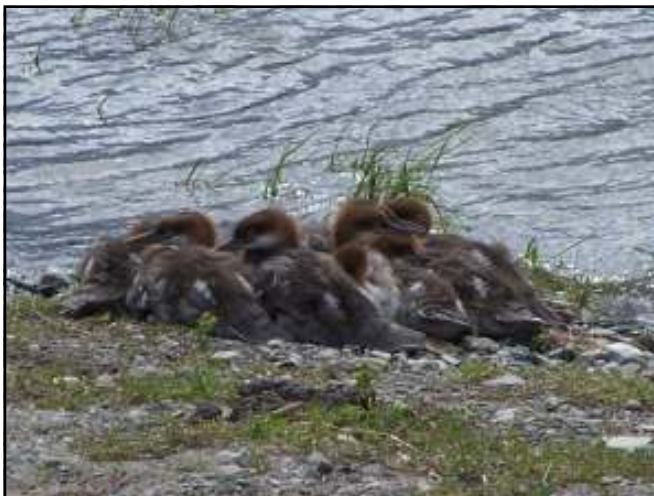
Merganser chicks from Katmai National Park