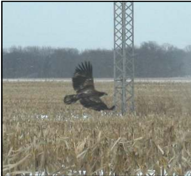
Eagle in Corn Stubble

Emiquon Audubon Society PO Box 502, Havana, IL 62644 http://sciencespot.net/eas/