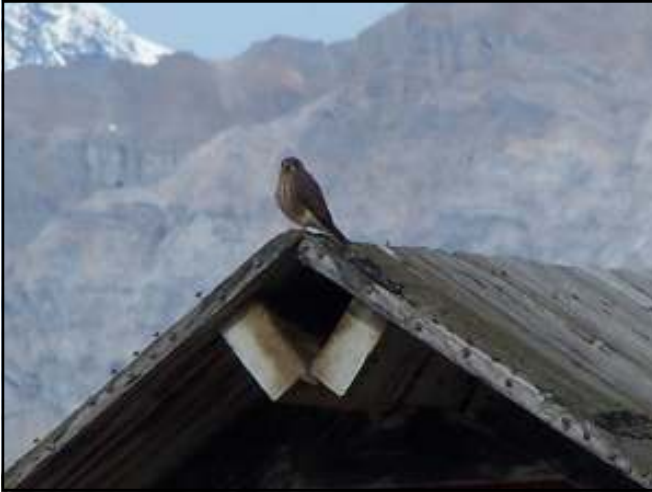
Kestral at Wrangell-St. Elias National Park